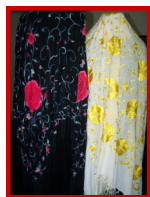
Exhibit beginning July 15 th ...