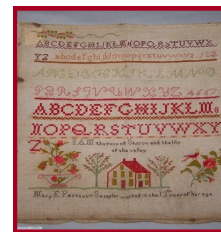
Exhibit starting June 29 th

"Mark My Words" Samplers from the collection