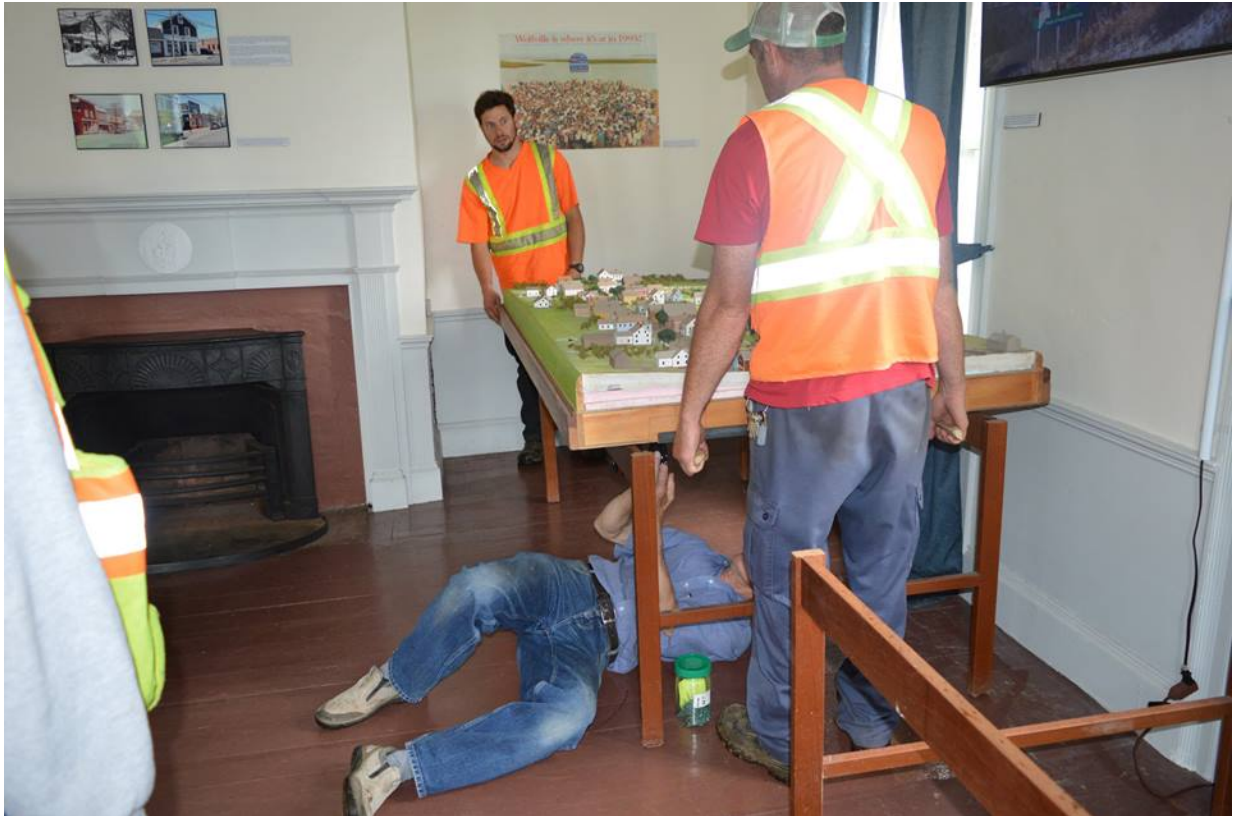
Co-operation from the Town in installing the model of Wolfville in 1893